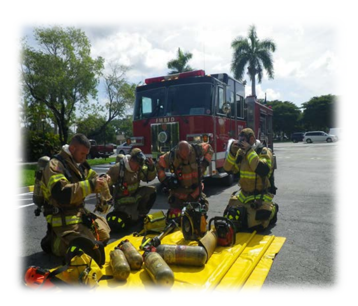
See the Probationary Firefighter Position Description on our website: <u>www.fmbfire.org</u> for further requirements.

The Firefighter/Paramedic participates in aggressive training programs, regular drills, and responds to emergencies as a team member.